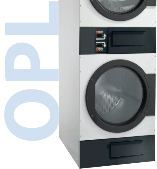
AD-333 OPL Stack Dryer