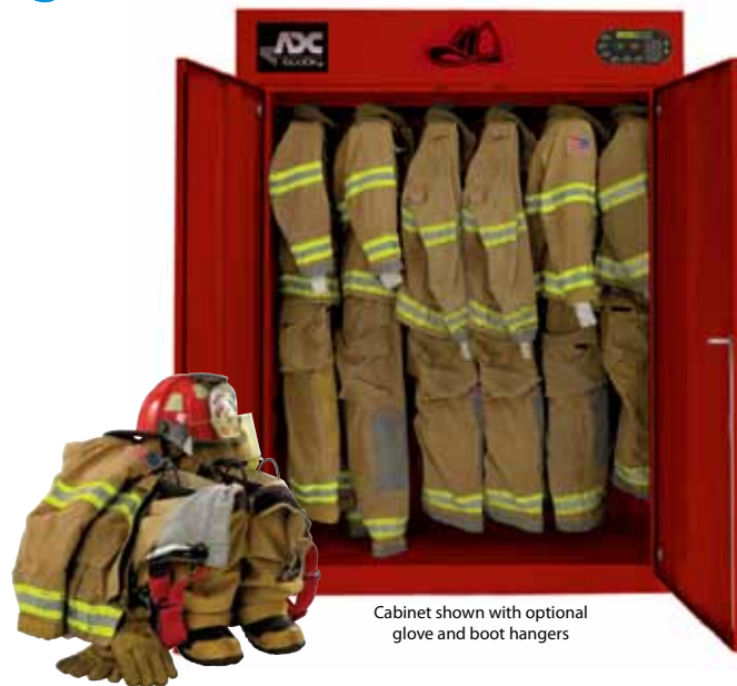
Cabinet shown with optional glove and boot hangers

Firefighters risk their lives everyday and depend on their equipment to protect them against the demanding and dangerous environment in which they work. The last thing they need to worry about is their firefighter's turnout gear. This is why ADC, the world leader in drying technology is offering the ADFG drying cabinet, designed specifically for drying firefighter turnout gear.