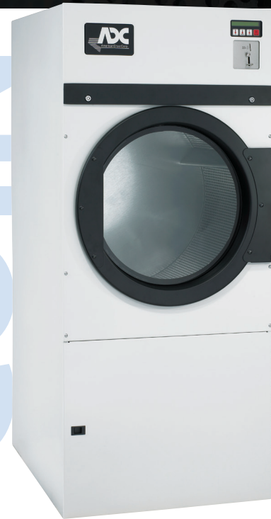
AD-24 Coin Dryer